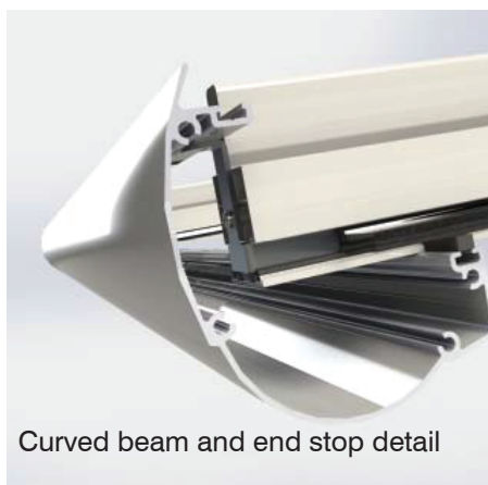
Curved beam and end stop detail