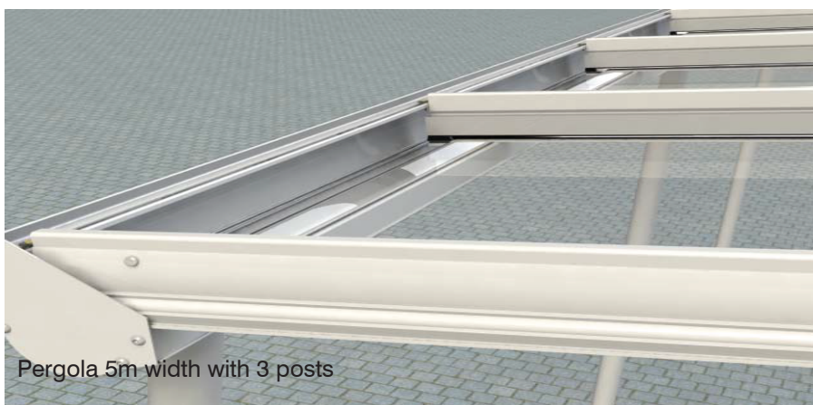
Pergola 5m width with 3 posts