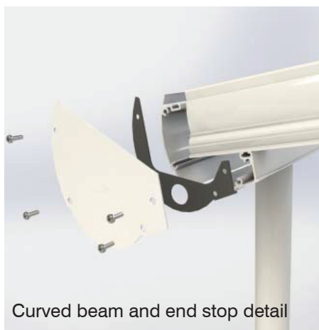
Curved beam and end stop detail