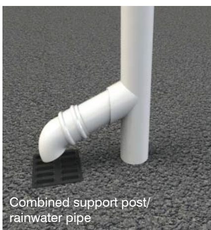
Combined support post/ rainwater pipe